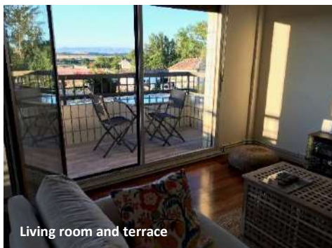
Living room and terrace